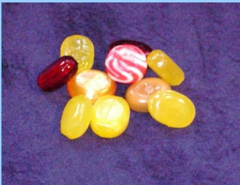
A collection of lollies.

The case has been referred to a coroner.